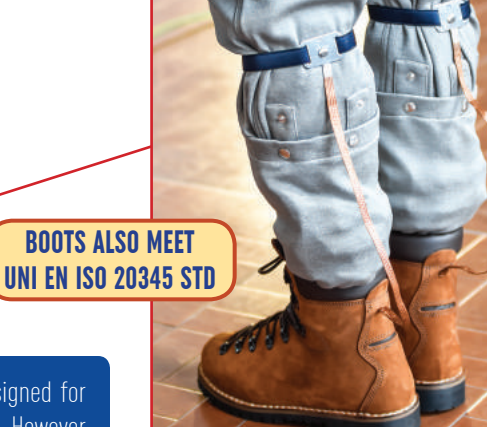
Comfortable Fine Leather Lineman Conductive Boots with Braided Copper Leads & Calf Straps. Meet IEC 60895 Std & UNI EN ISO 20345 Std.