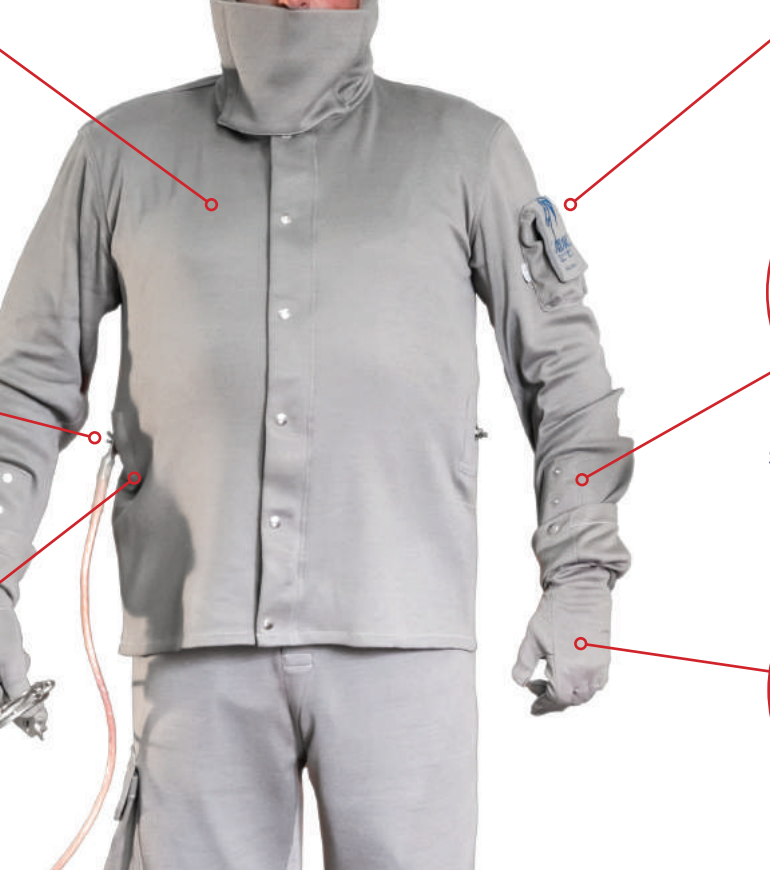
Two-Piece design's suspender supported trousers are tied to the jacket by two internal side conductive cloth straps and one Velcro® strap located on the back. Jacket uses metal zipper, Velcro® straps & snap buttons for front closure. Suit has two pockets, one on the left sleeve & one on the right thigh. You can specify metal bonding clamp or cloth bonding straps.