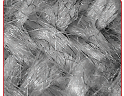
Microscopic view of a typical suit using stainless steel fibers (black strands) in a woven fabric.