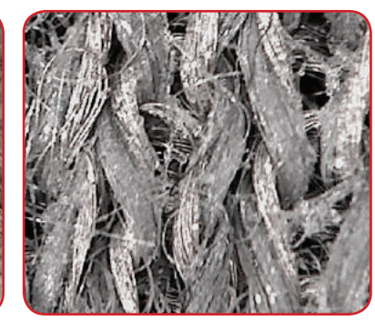
Microscopic view of Carraro Conductive Suit with helically wound silver yarn (shiny silver) in comfortable knit fabric.