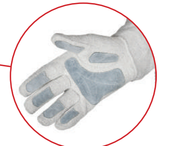
Exclusive "Grip Patches" are made of genuine split-grain leather.