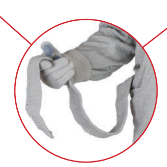
Optionally two screw-on elastic cloth "Bonding Straps" in place of single metal Bonding Clamp can be specified.