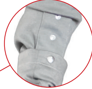
Sleeve & Glove design ensure proper bond between worker and the entire suit.