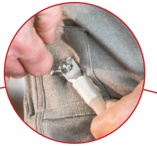
Metal Bonding Clamp screw-on attachment. One conveniently located on each side of the suit torso