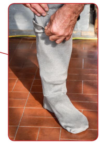
Stretch-Top Socks are comfortable yet extremely durable. Snap Buttons ensure proper bonding with the trousers.